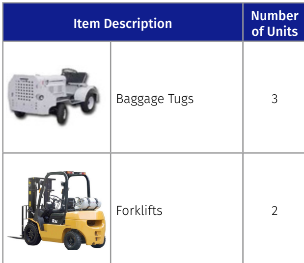
Inventory as of AUGUST 2017